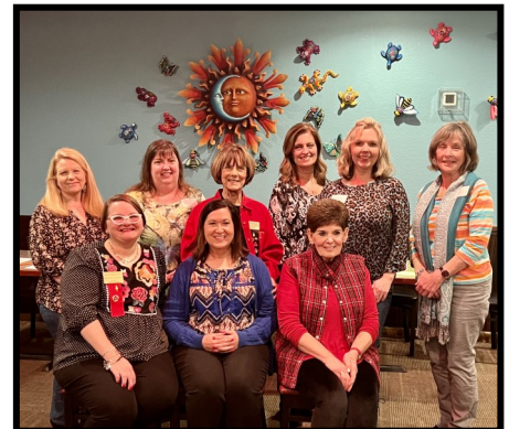
Members of Iota Rho