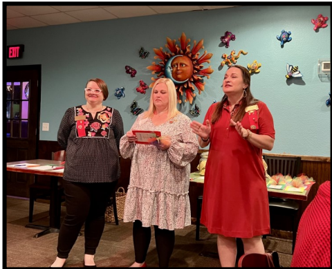
Chapter Presidents welcome everyone.