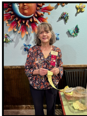
Door prizes! No, we didn't win.