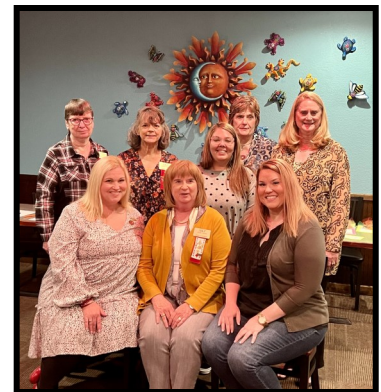
Members of Alpha Omega and Shalan.