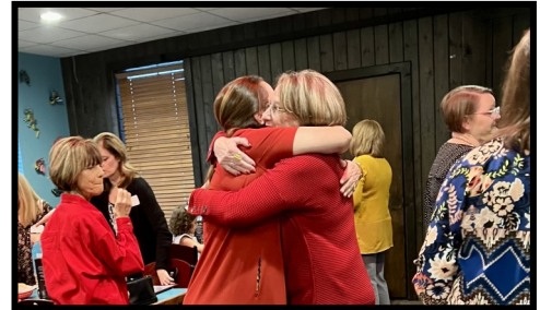
Rekindling old friendships.